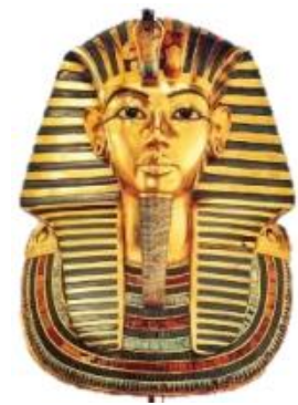
Tutankhamun's death mask.

Timeline 3500BC First use of hieroglyphic symbols. 2550BC Pyramids at Giza were built. 1336BC Tutankhamun became the youngest pharaoh. 30BC Egypt was taken over by the Romans. 1922AD Howard Carter discovered Tutankhamun's tomb.