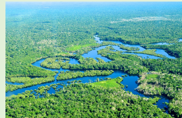
The Amazon Rainforest, Brazil.

Tropical rainforests are endangered because of deforestation as a result of farming and food production, road-building and settlement development.